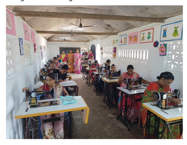
Tailoring training. Women can work from home