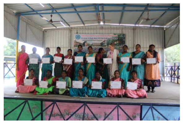
Certification by the government to obtain a loan to buy stitching machines.